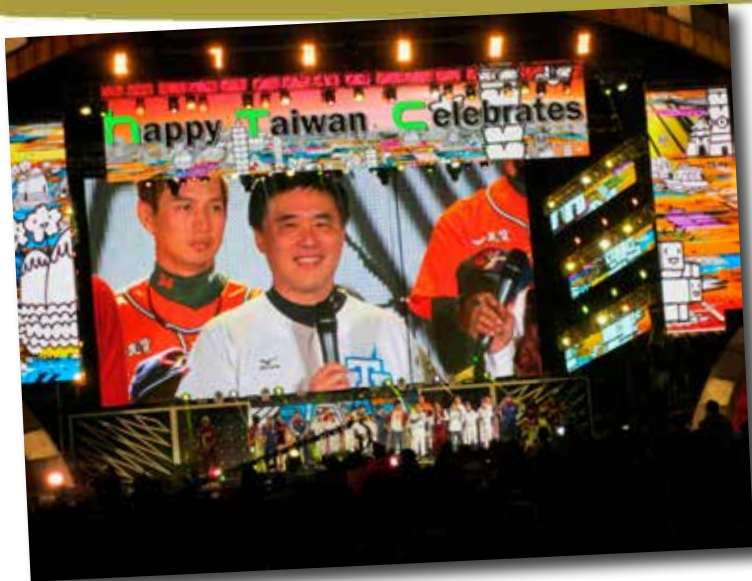
Taipei 101 New Year's Eve concert - the Mayor of Taipei says Happy New Year!

This year 2014 marks the 60th anniversary of the Taiwan Episcopal Church and the main