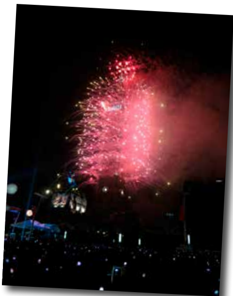
Taipei 101 New Year's Eve concert