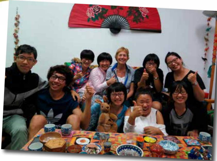
"Relaxed English" class at my house

singing lessons and showed them cards and letters written by children at Heighington School. I even got her involved here at St. John's University in my "Relaxed English" class for students and a photoshoot for our new university promotional DVD – she fitted the role perfectly, so elegant!